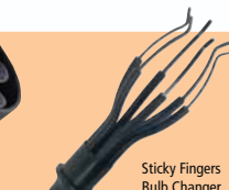
Sticky Fingers Bulb Changer