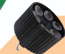
Flood Sucker Bulb Changer