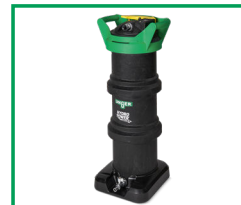
HydroPower® & nLITE®