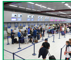
HIGH TRAFFIC AREAS