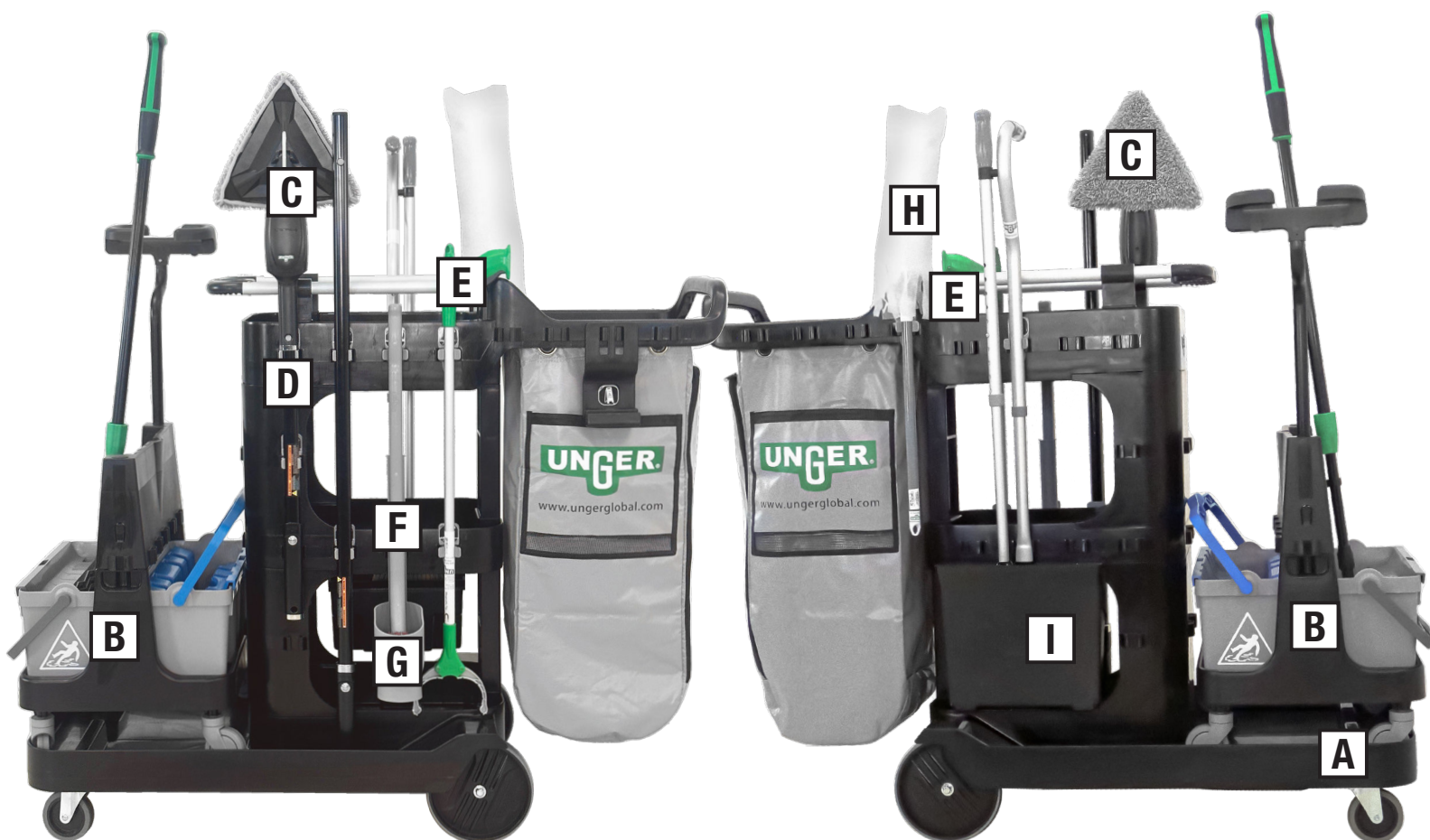
DeepClean Rx Janitorial Cart System PART NO.: CRTDC CASE QTY: 1