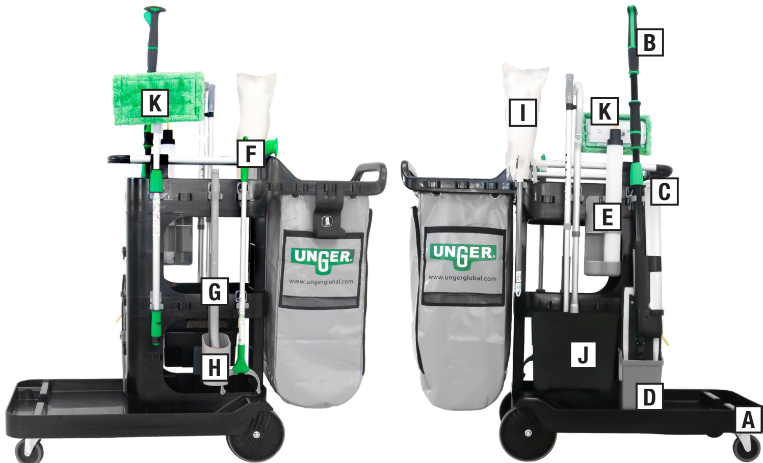
SpotClean Rx Janitorial Cart System PART NO.: CRTSP CASE QTY.: 1