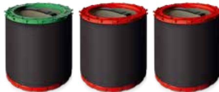
HydroPower Ultra Large Tank Resin (3)