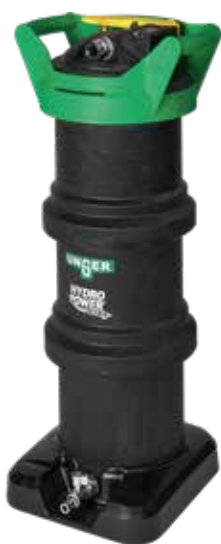
HydroPower Ultra Large Tank