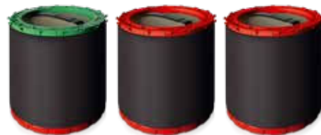
HydroPower Ultra Large Tank Resin (3)