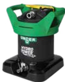
HydroPower Ultra Small Tank