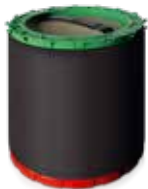
HydroPower Ultra Small Tank Resin