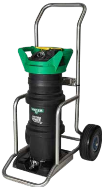
HydroPower Ultra Large Tank with Cart

Designed to be the perfect fit for professional window cleaners that demand the best for their window washing services. With over 30% more pure water per resin filling, the FloWater Technology 2.0 ensures an efficient flow of water through the whole tank, optimizing the resin saturation.