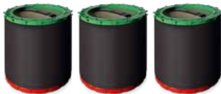
HydroPower Ultra Small Tank Resin (3)