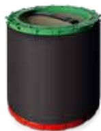
HydroPower Ultra Small Tank Resin