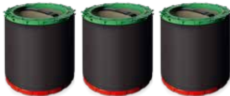
HydroPower Ultra Small Tank Resin (3)