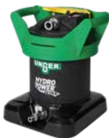
HydroPower Ultra Small Tank